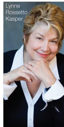
Lynne Rossetto Kasper